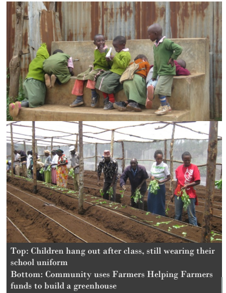
Top: Children hang out after class, still wearing their school uniform Bottom: Community uses Farmers Helping Farmers funds to build a greenhouse

Each of the Kenyan schools hosting a UPEI Pre-service teacher is also partnered with a school in PEI through the Farmers Helping Farmers School Twinning Program. Our UPEI Pre-service teachers' sharing their Kenyan teaching experience with students and teachers in the PEI partner schools provides an amazing learning opportunity for children in PEI. The teachers returning from Kenya often describe the experience as life- altering and value the opportunity to share their experience with PEI students.